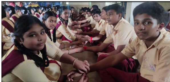
'Rakshābandhan' Programme was conducted by Sāhitya club at our school.