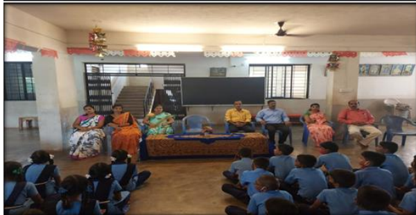
A parent-teacher meeting of class 8 th in progress in June 2022