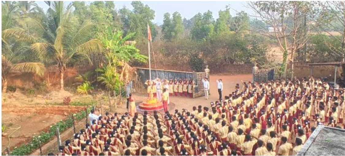
15 th August 2022, Hoisting of the National Flag