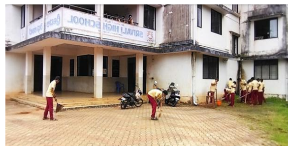
Cleaning programme held at our school on 30th October for 9 th and 10 th standard students