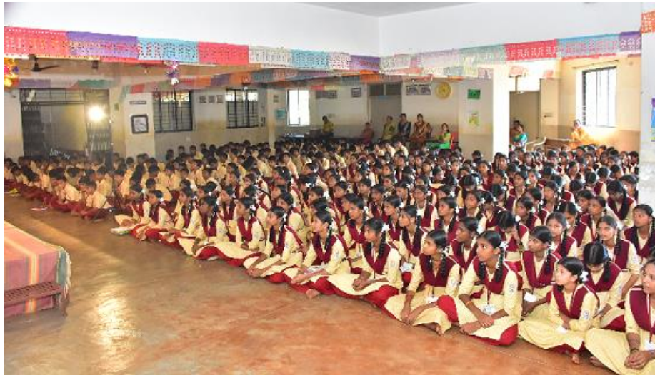
Annual Gathering & Prize Distribution Program of 2022-23 organized at our school.