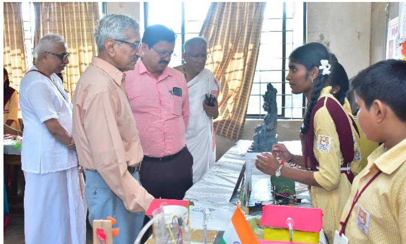
Science exhibition by students of our School