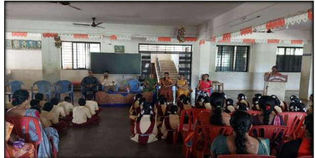
A parent-teacher meeting was called for class 9 th on 3rd June 2022