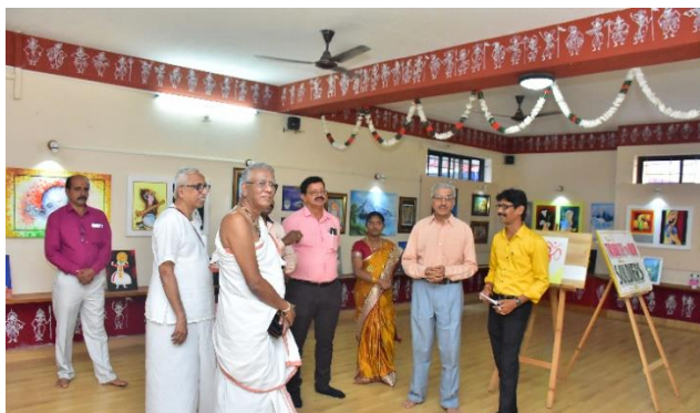
The School Art Exhibition Hall which is one of the highlights of the School