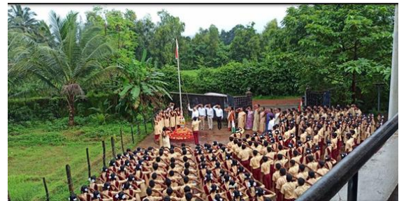
75th year Independence day celebration at our school.