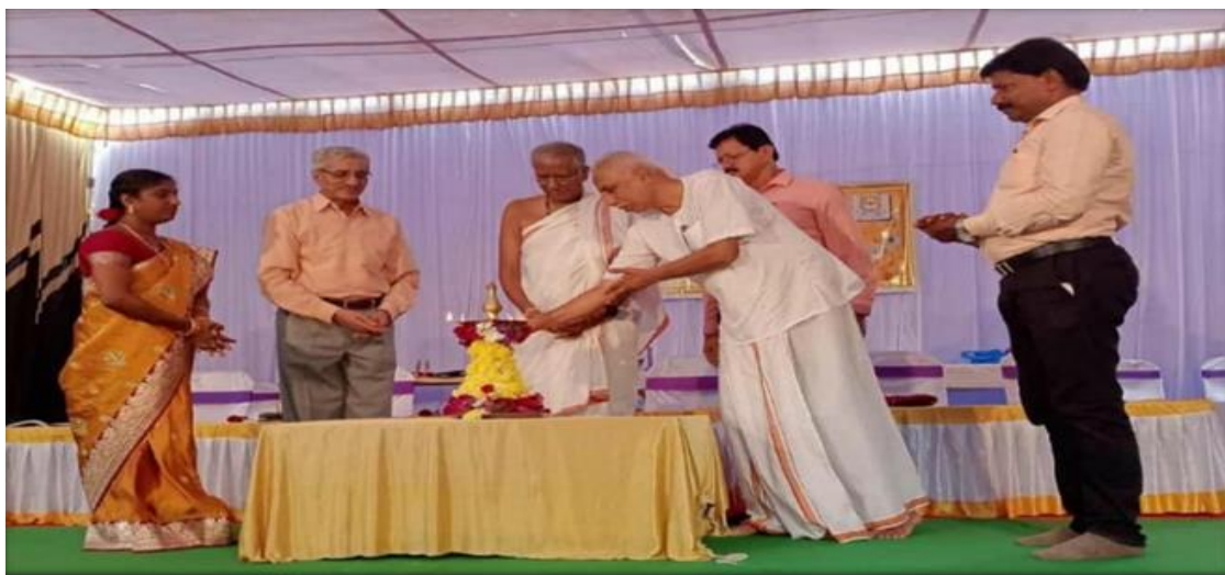
Annual Gathering & Prize Distribution Program of 2022-23 organized at our school. Lamp Lighting function