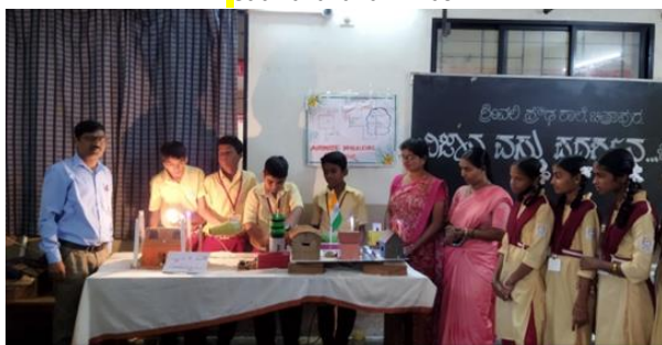
The science Exhibition organized at the school level for 8 th standard, 9 th and 10 th standard students