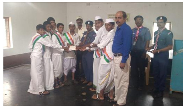
Singing competition conducted by Bharat Scout and Guides