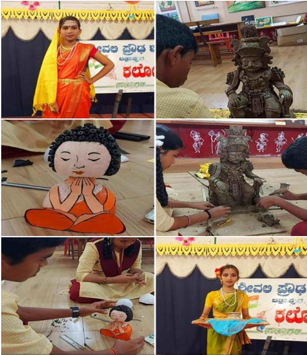
Department Level Kala Utsava competition conducted for our students at district level