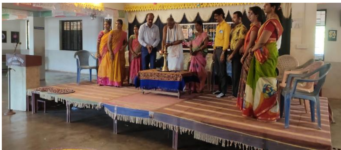
Beginning of Prize Distribution Programme. Lighting of the Lamp