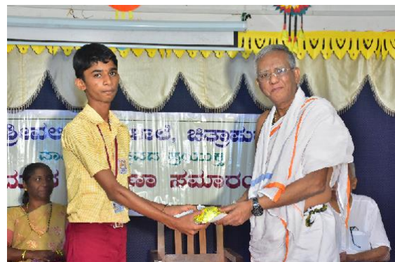
Prize Distribution function in progress