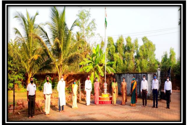
Celebrated " Republic Day" at our school