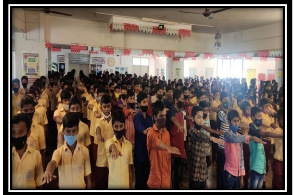
Celebrated “ Constitution Day” at our school