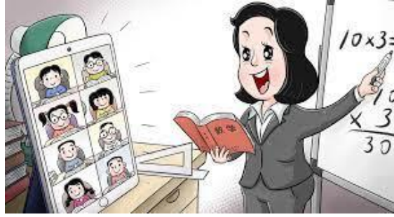
Online Classes during the Pandemic