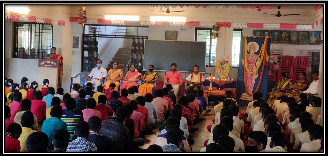
Celebrated “Kannaḍa Rājyostava” at our school premises. Our students performed dances, sang songs and delivered speeches on the Kannaḍa language