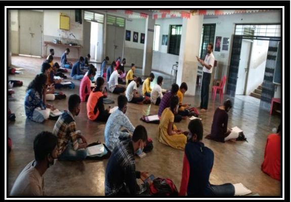
Teaching students usage of the Teachmint App