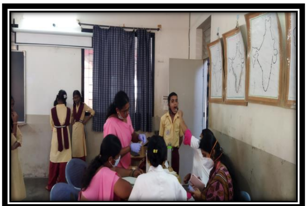
Covid Tests conducted for 9 th Standard Students on behalf