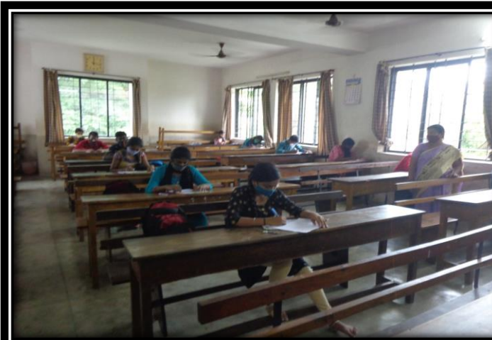
District-Level New model Exam for SSLC students