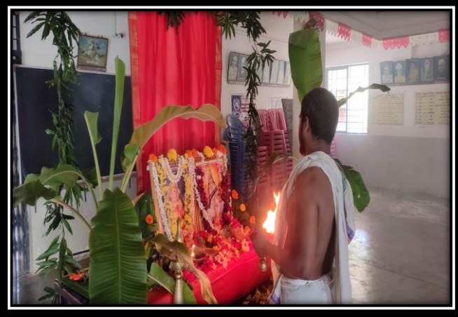
Shāradā pūjā and Gaṇahoma at our school