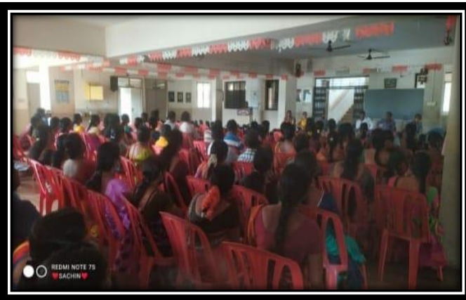
Conducted 10th std Parents-Teachers meet and school re-opening, students’ progress