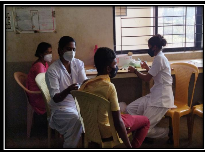
All 8th, 9th and 10th std students have got 2nd dose vaccination at our school through the Tāluk Health Department