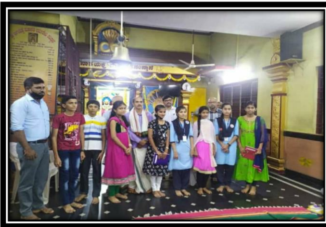
Shri Bhagawadgītā Abhiyān at Tāluk -level “Bhagawadgītā Recitation” and speech competitions were held at Nāgāyakshe Temple, Bhaṭkal