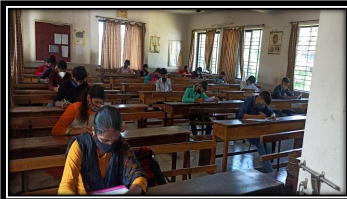
Practice exam for the SSLC students at the school- level