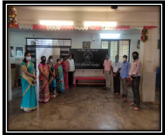
We celebrated "National Yoga Day" at our school