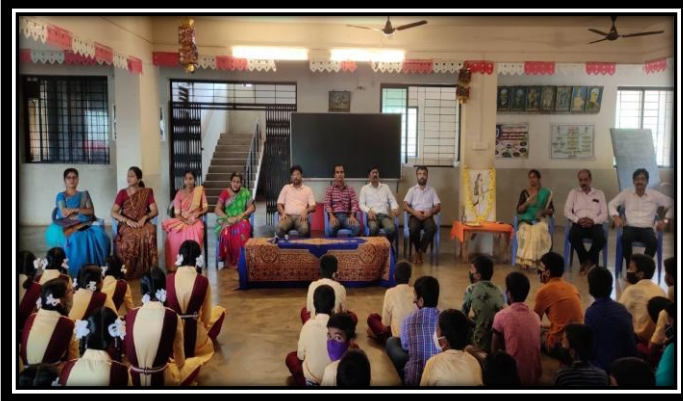
Celebrated “Kanaka Dās Jayanti” at our school premises