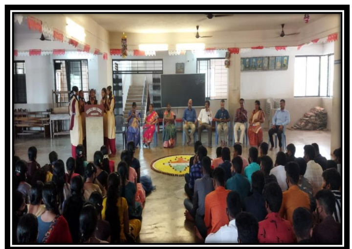
Farewell program for SSLC students