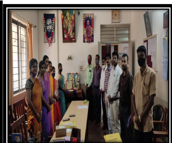
Celebrated "Gāndhī Jayantī" at our school