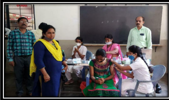
All 8th,9th and 10th Std students who have completed 15 years got COVID Vaccination at our school