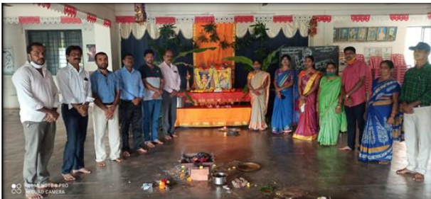
On Vijayādashamī Sharada pūjana and Gaṇahoma at our school