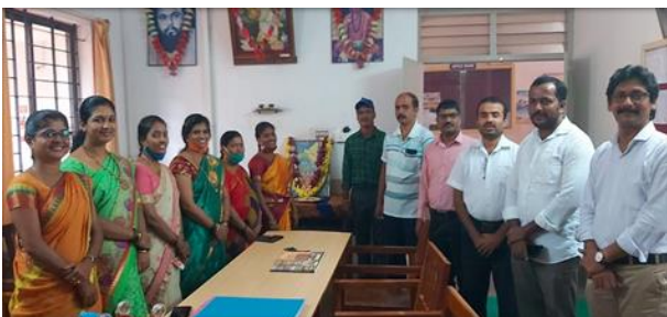
Celebrating Kannaḍa Rājyotsava at our school