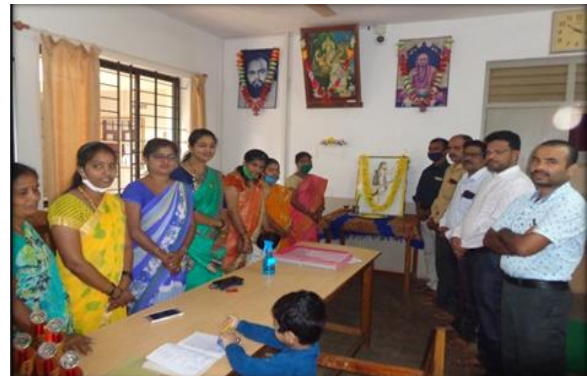
Kanakadasa Jayantī on 3 rd December, 2020