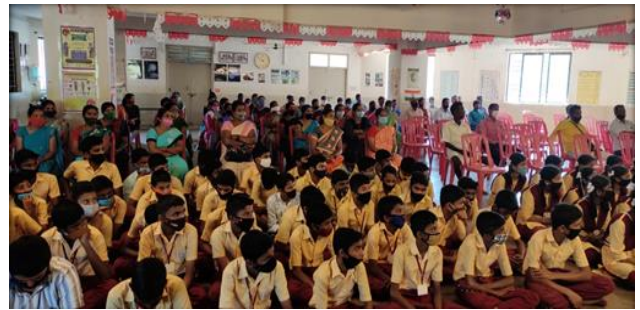
PTA for SSLC students to discuss progress