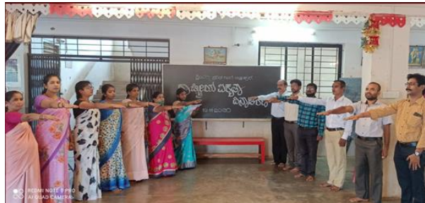
On National Unity Day oath-taking by our teachers