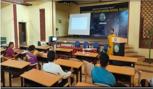
The 2 nd English Subject workshop had at Vidyābhārati English Medium School, Bhaṭkaḷ