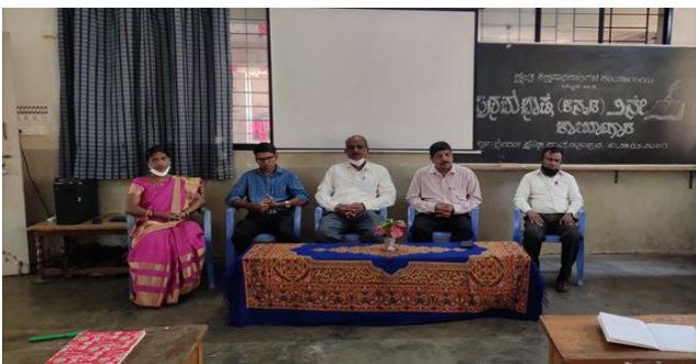
Kannada language workshop at our school