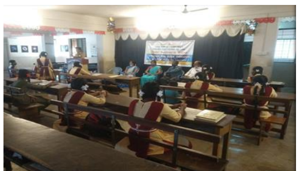
Celebrating National Girl Child Day in our school