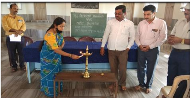
Mathematics Workshop at JVS, Murdeshwar