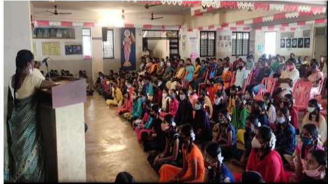
PTA for 8 th Standard students