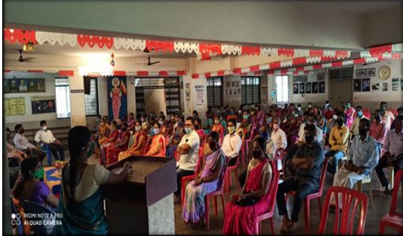
SSLC students' PTA to discuss Vidyāgama learning process