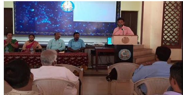
Tāluk-level Social Science Workshop at Vidyābhārati High School, Bhaṭkal.