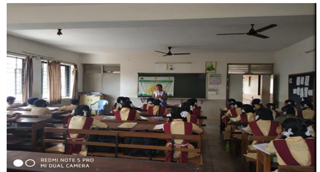
Awareness programme by Yuvā Spandana Association of Kārwar on personal and mental problems