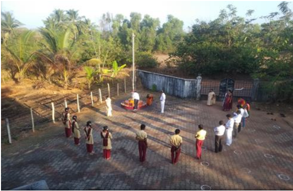
Republic Day Celebrations