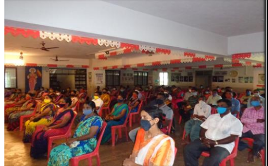
9th Std PTA to discuss Vidyāgama learning process