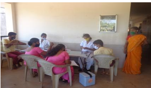
T.T.Injections been administered by Tāluk Health Dept