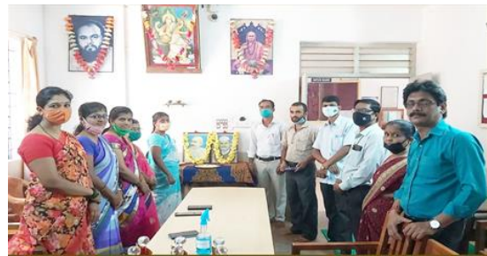
Celebrating Gandhī Jayantī and Lāl Bahādur Shāstrī Jayantī at our school