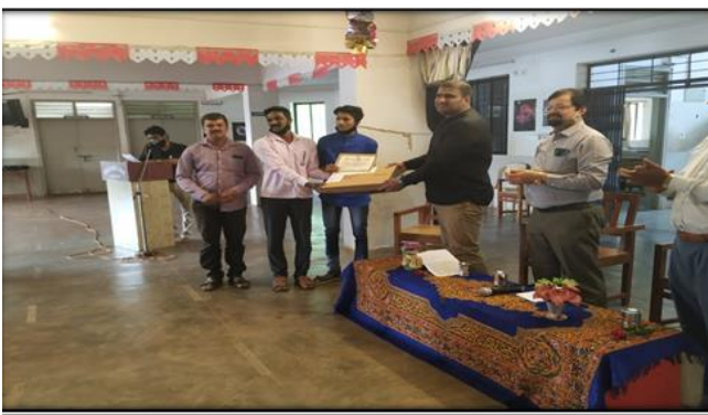
Felicitation of students with laptop, bag and certificate