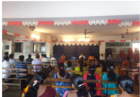
S.S.L.C. parents and teachers meeting-December, 2020