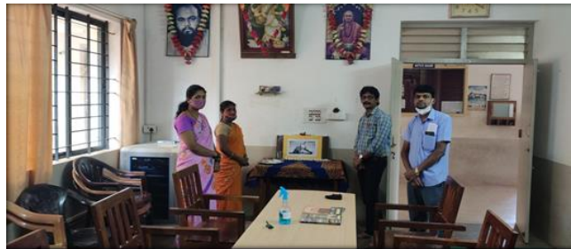
Celebrating Vālmikī Jayantī at our school