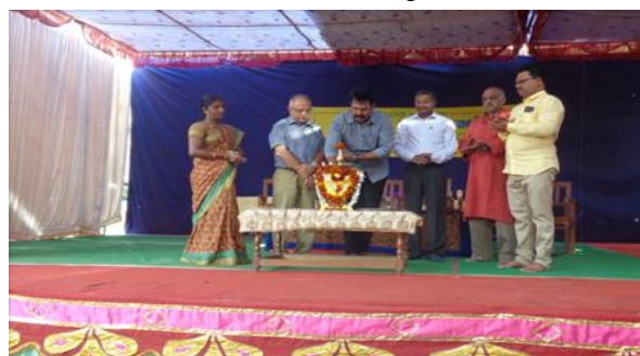
Lighting of the Lamp on occasion of Annual Day