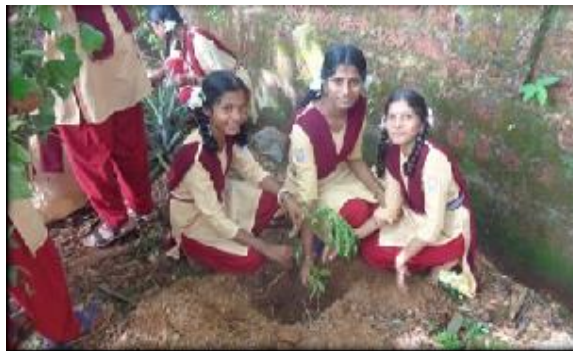
On the occasion of the World Environment Day – Planting of Saplings