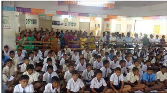
P.T.A. meeting for 8 th Standard in progress