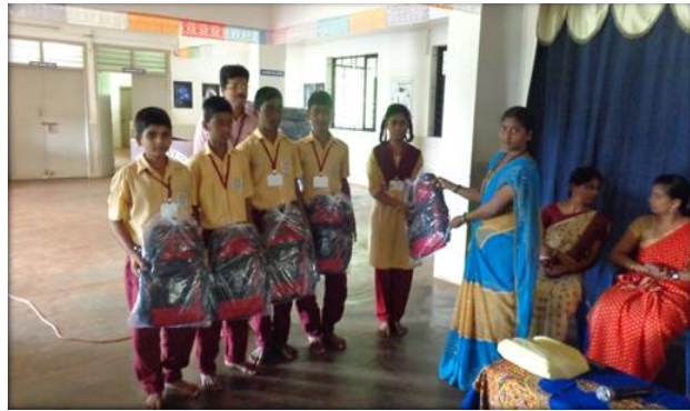
Distribution of School Bags and Belts