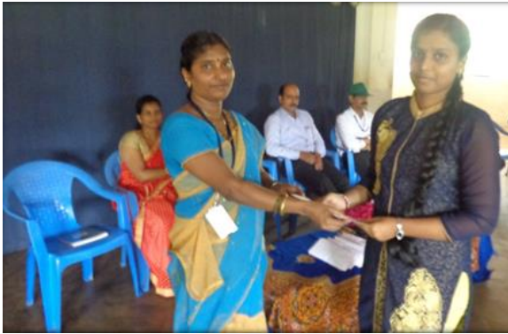
Cash Incentives been distributed to ex Students