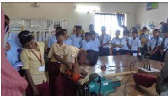
Students of V.V.Deshpāñde school of Excellence at the VTC