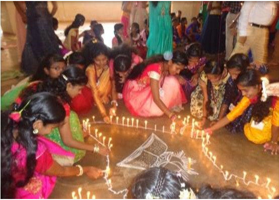
Farewell function for the SSLC Students