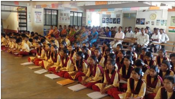
P.T.A meeting for SSLC Students in progress