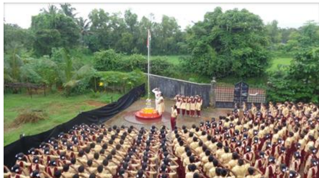
Independence Day Celebrations