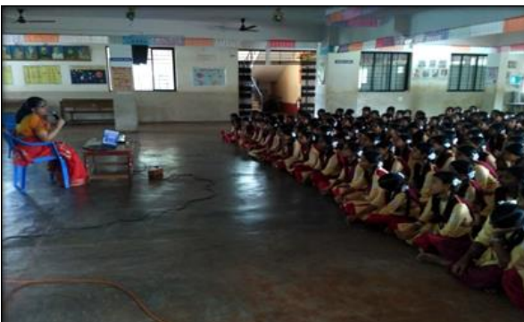
Dr.Sunainā Rāo addressing the girls on personal hygiene