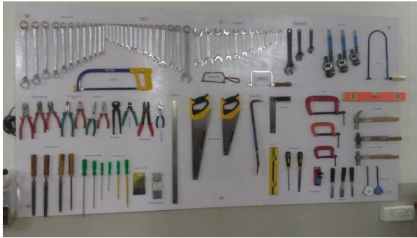
THE TOOL BOARD