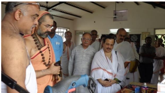
HH SWĀMĪJĪ BEING SHOWN AROUND THE CENTRE