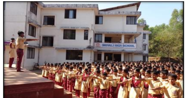
Taking a Pledge on National Integration Day