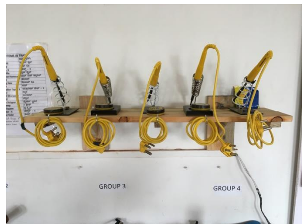
SHELF WITH WOODEN BRACKET