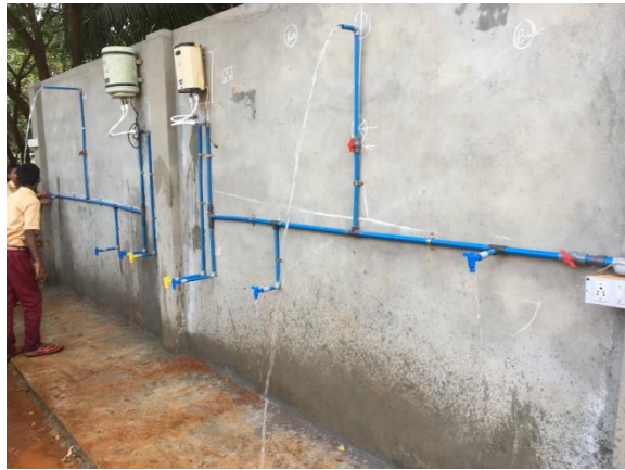
WATER FLOWING THROUGH THE PIPES