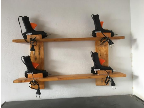
TWO- LEVEL SHELF