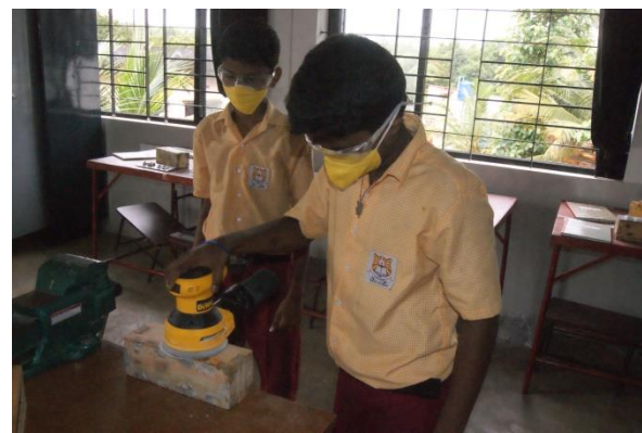
SANDING USING THE RANDOM ORBIT SANDER