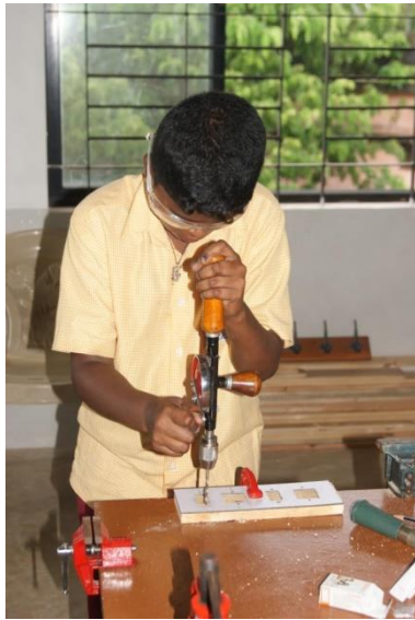
USING HAND DRILL