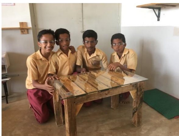
COFFEE TABLE WITH GLASS TOP