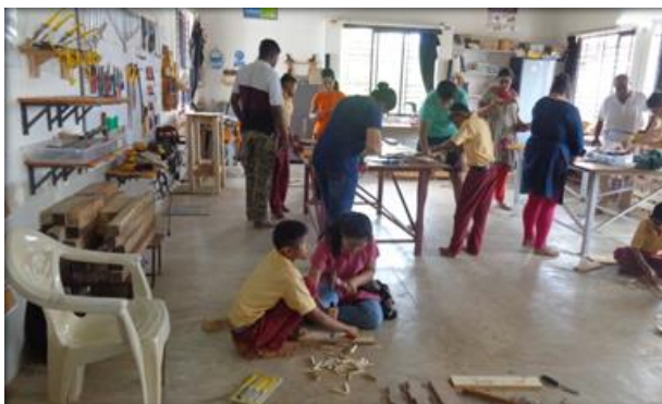
Yuva-s at the Vocational Training Centre. The young students of the School guided and helped the Yuva-s