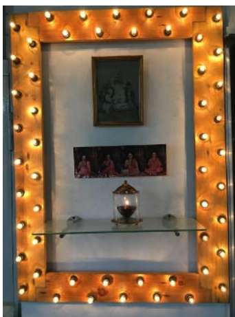
THE GARLAND OF LIGHTS