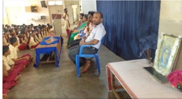
Ambedkar Jayanti celebrated on 14 th April