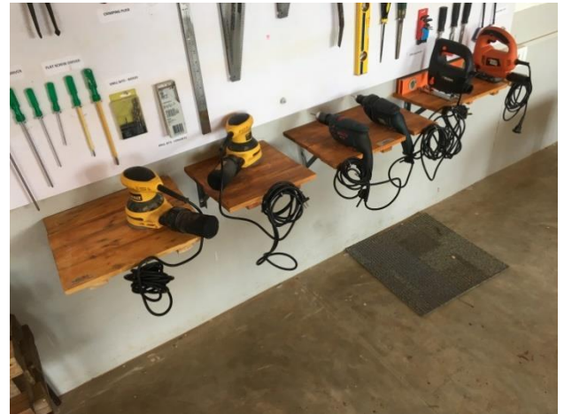
SPECIFIC DESIGN SHELVES FOR POWER TOOLS