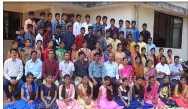
Farewell programme for the 10 th Standard students