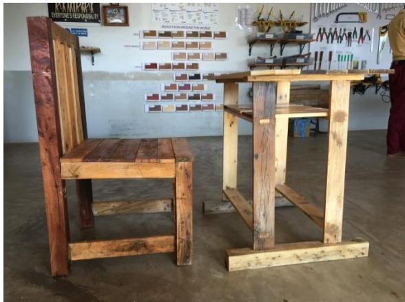
TABLE AND CHAIR