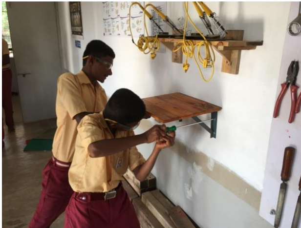
SHELF WITH STORE -BOUGHT STEEL BRACKETS