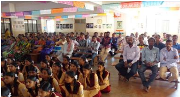
Parents-Teachers Meeting in progress