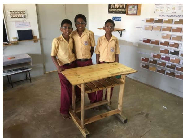
THE YOUNG TABLE- MAKERS !