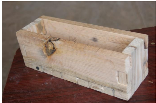
THE BASIC BOX