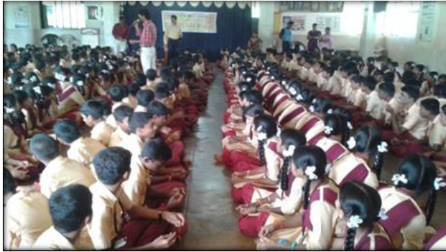
Celebrating Raksha Bandhan