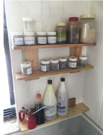
SHELF FOR CONSUMABLES