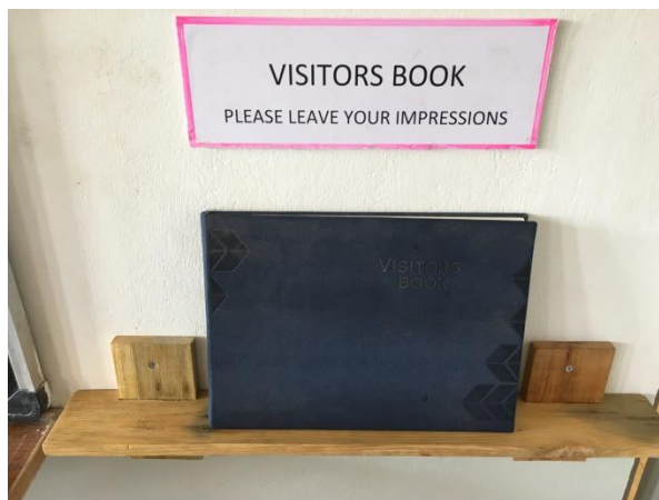
A SIMPLE SHELF