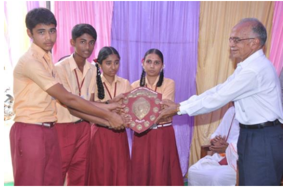
At the Annual Day Celebration – Recognition & Awards!