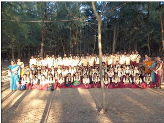
At the Annual School Picnic