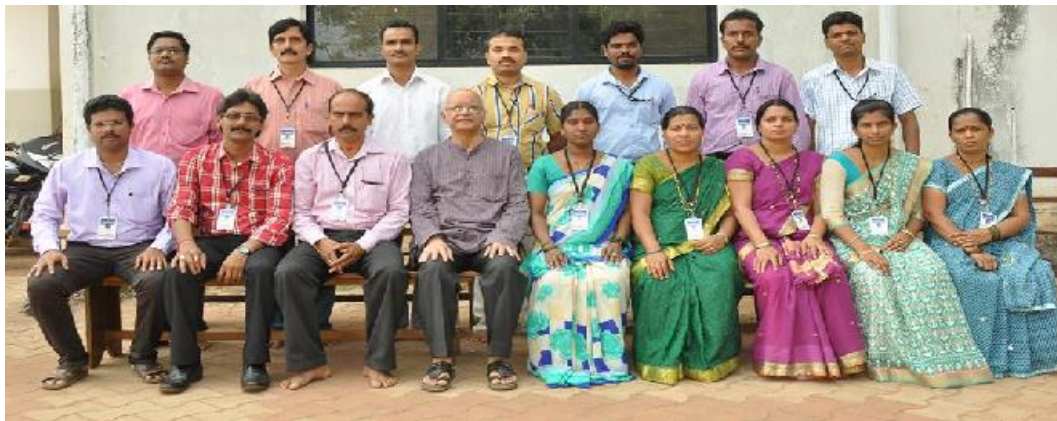
The School Staff