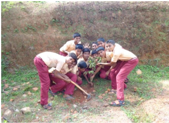
Vana Mahotsava Day