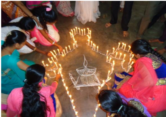
At the Farewell programme for the SSLC Students