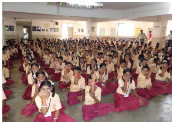
Rakshabandhan Celebration at the School