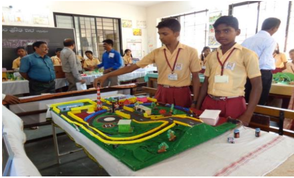
Our Students exhibit their innovative project at the Science Exhibition held at the Taluka- level