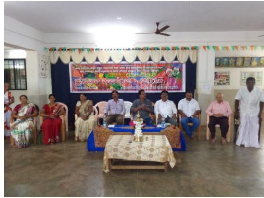
Taluka -level PRATIBHA KARANJI -2015/16 was held at our School premises.