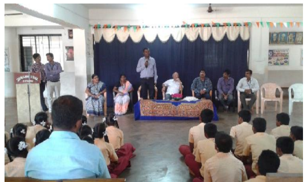
Student- Interaction with Teachers in progress