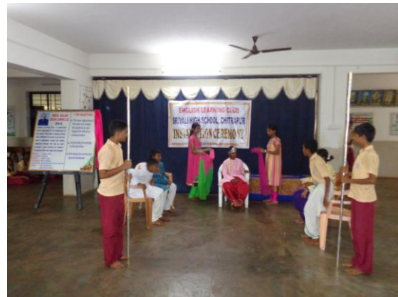
At the Inauguration of the English- Learning Club