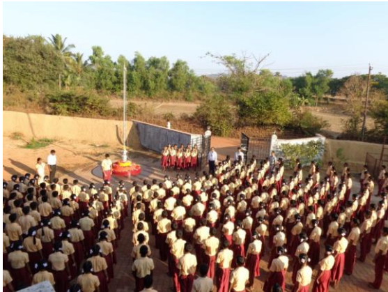
Republic Day Celebrations on 26 th January, 2016