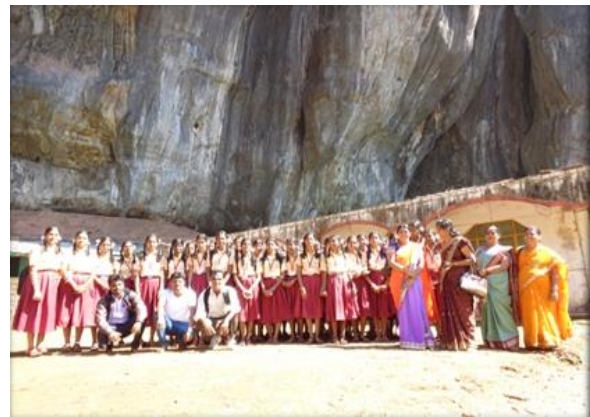
At the Annual School Picnic