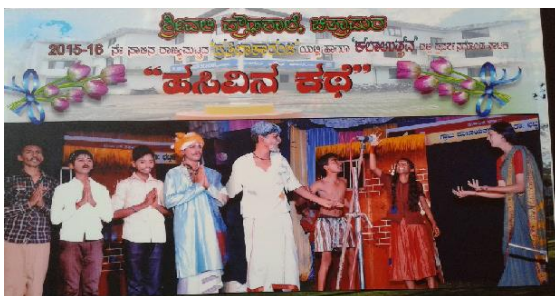
At the State-level Dramatics Competition