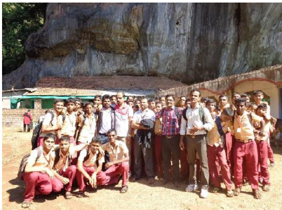
At the Annual School Picnic