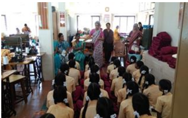
54 Girl students of the 10 th Standard underwent orientation & training at Samvit Sudha